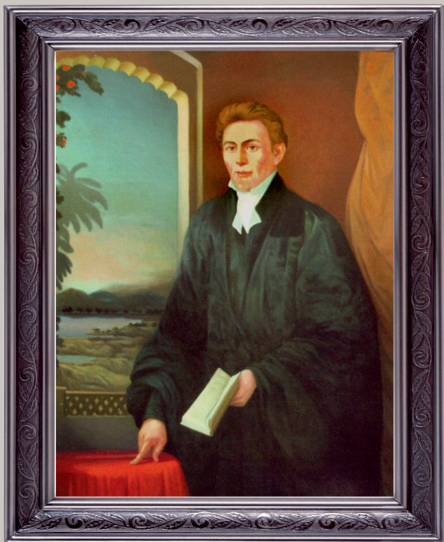
Rev. Dr. Alexander Duff FOUNDER OF THE COLLEGE