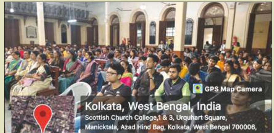
Inauguration of The Activity Club