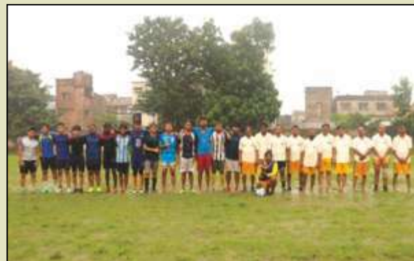
Teachers' Day Celebration on 05.09.2022 - staff vs students football