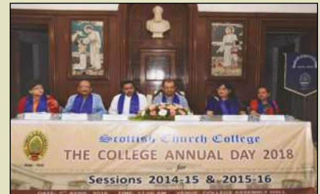
The College Annual Day-2018