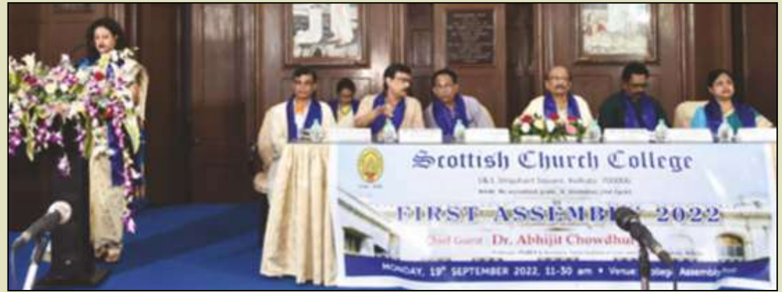
First Assembly 2022