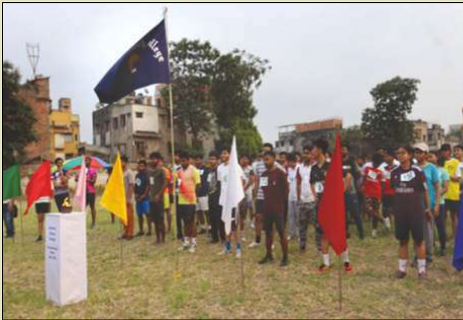
Annual Sports 2022