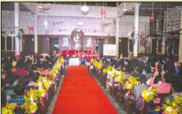
Christmas Program 2018-2