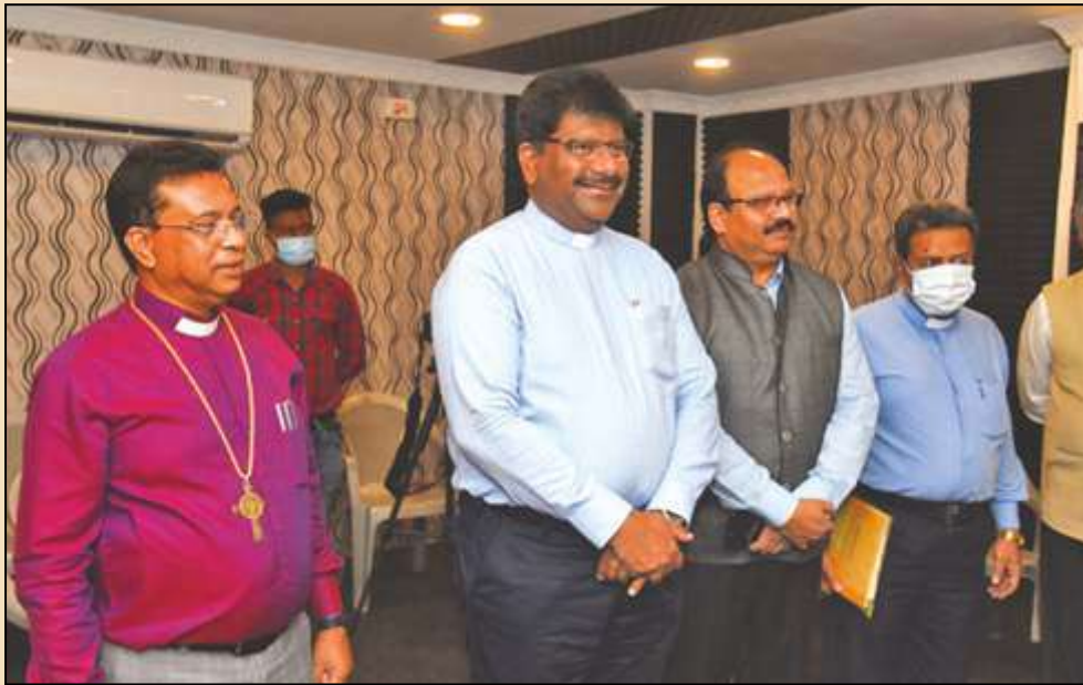
Inauguration of Recording Room, 2021