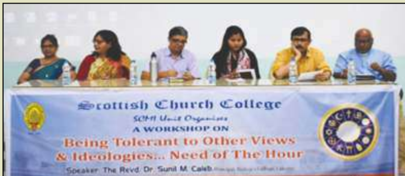
SCMI Programme 2019