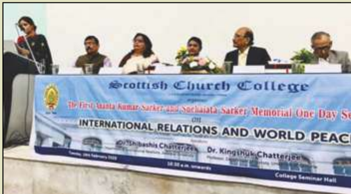
Lecture on International Relations-World Peace