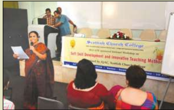
Soft Skill Development and Innovative Teaching Methods-2018