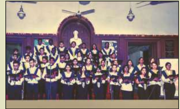
Christmas Program 2018-1