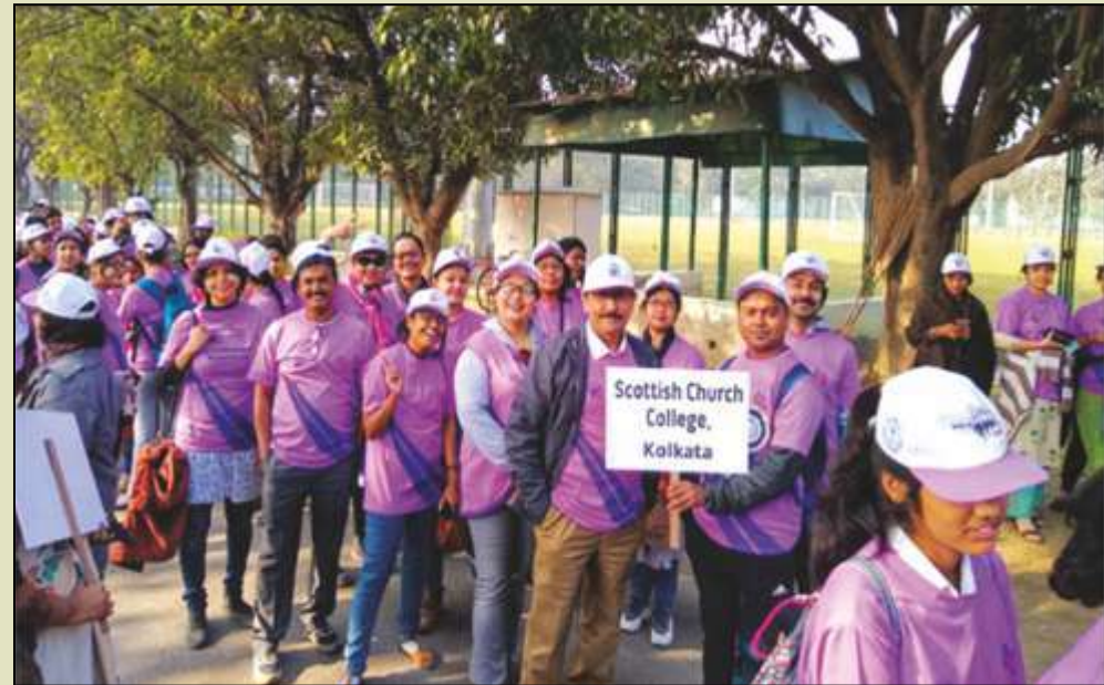
Participation of Scottish Teachers in the Walk for Mental Health Program