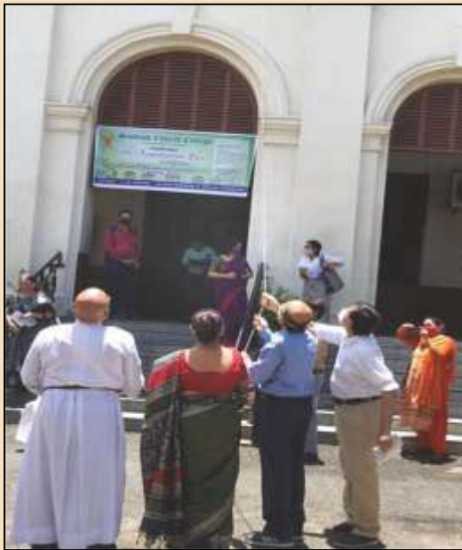
192nd Foundation Day, 13.07.2021