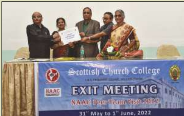
NAAC PEER TEAM