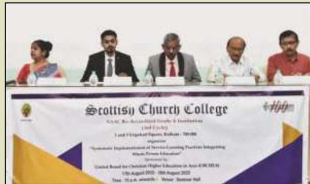
"systematic implementation of Service-Learning practices Integrating whole person education"(UBCHEA).