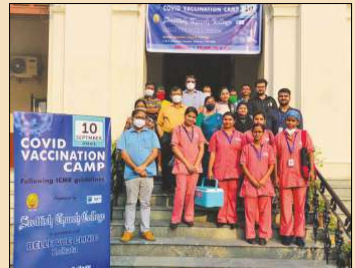
Covid Vaccination Camp