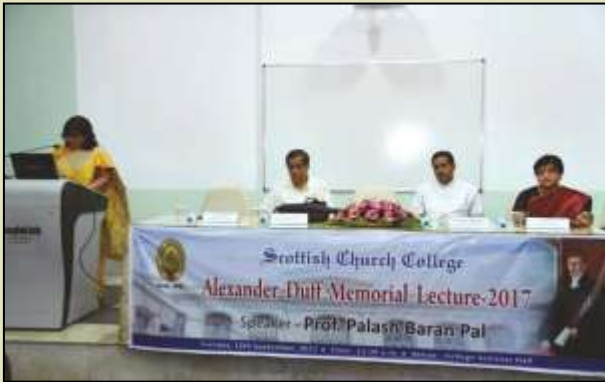
Alexander Duff Memorial Lecture - 2017