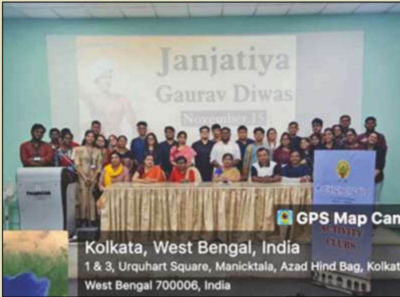
Celebrating The Birth Anniversary of Birsha Munda