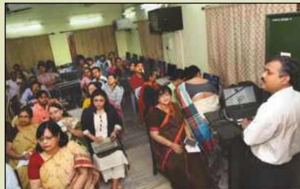
ICT Program 2018