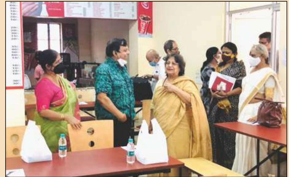
Webinar on "INA and the Secret Services of Netaji Subhas Chandra Bose".