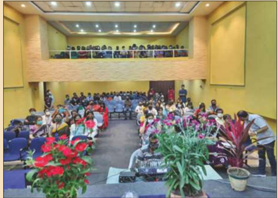
Women's Day Celebration 2022