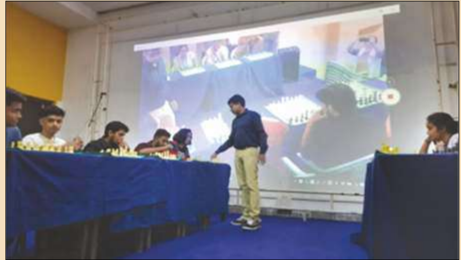
Inauguration of The Chess Club