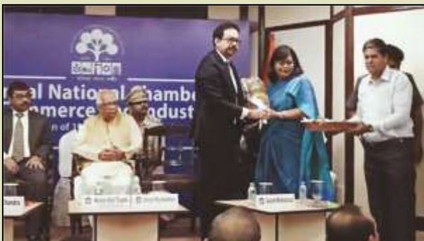
Bengal National Chamber of Commerce Felicitating the College