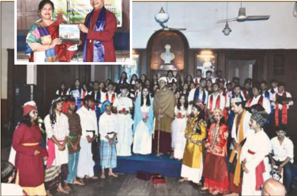
Christmas Concert 2022