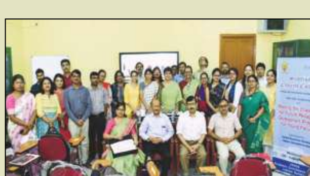
UB sponsored FDP