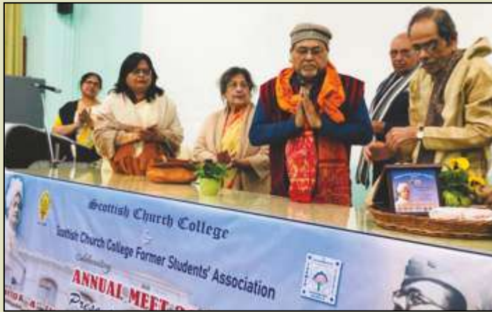
Former Students Annual Meet