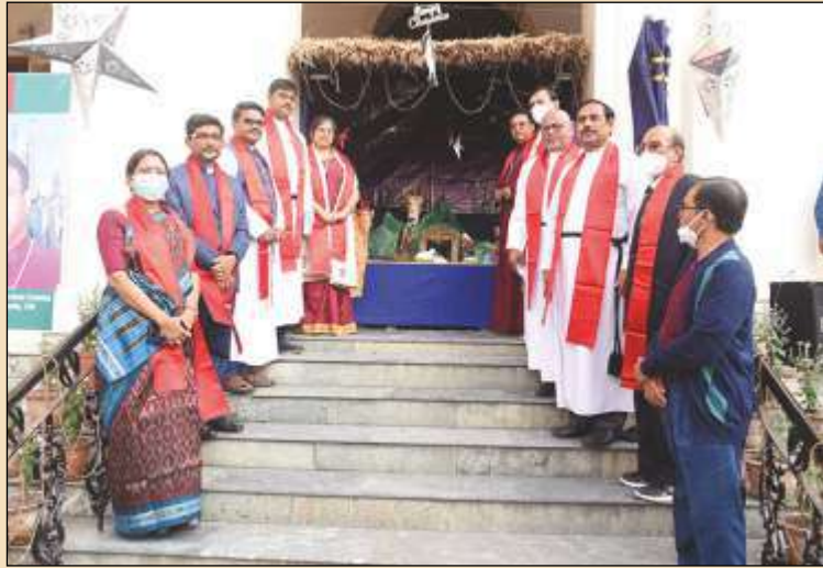
Christmas Concert 2021